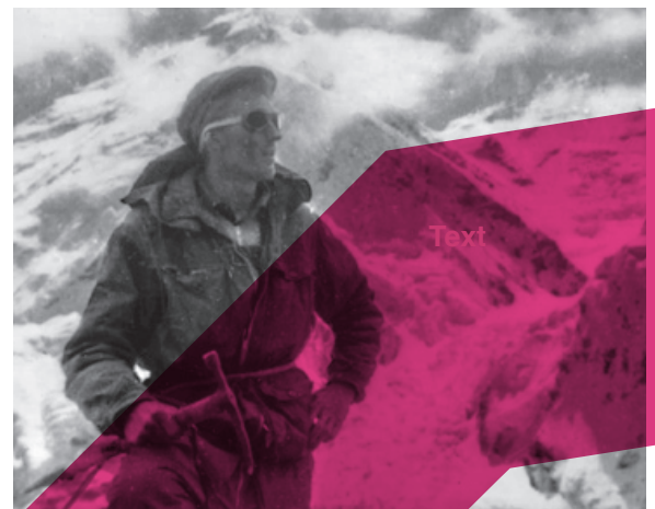
Hamish MacInnes, Everest, 1953

An Talla Solais Gallery, Ullapool IV26 2UG info@antallasolais.org